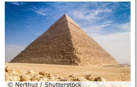
The Great Pyramid of King Khufu (Cheops) at Giza