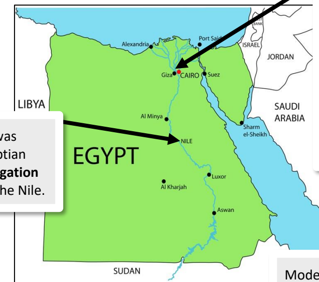
Modern map of Egypt

The River Nile was important. Egyptian people built irrigation systems along the Nile.