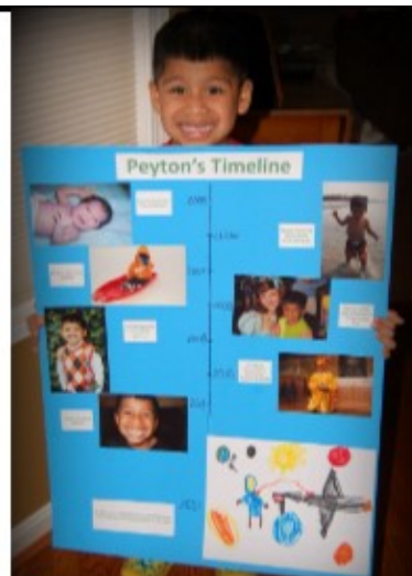
Timeline of My Life