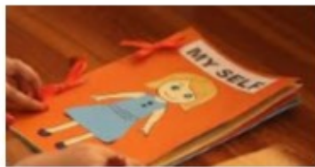
A booklet about My Self