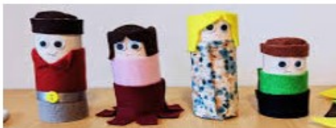
Model of family members