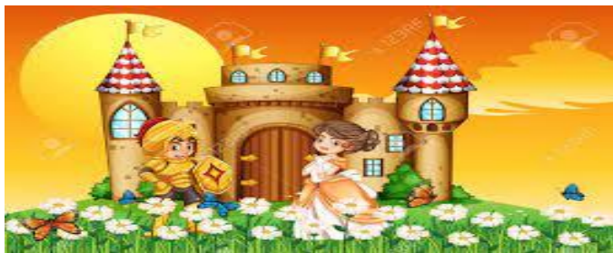
Nursery Spring 1