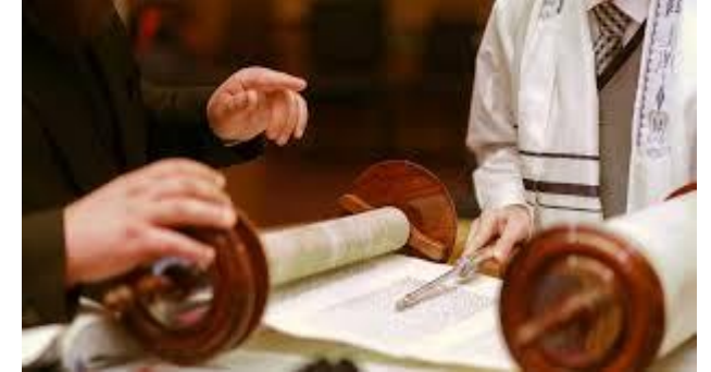
Bar and Bat Mitzvah

Jews have coming of age ceremonies: Bar and Bat Mitzvah.