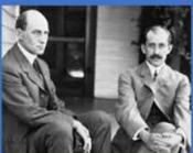
The Wright Brothers (Oliver & Wilbur)

American inventors who made the first flight in an aeroplane in 1901.