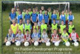
The Football Development Programme www.thefootballdevelopmentprogramme.co.uk

9am – 3pm each day Boys and Girls aged from 5 - 12 £65.00 for the week £15.00 per day (min 2 days)