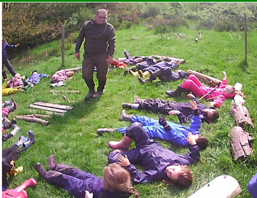
Red Class meditating in the forest.