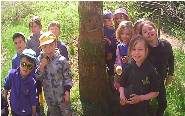
Red Class had fun in the forest last week.