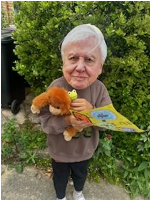
Who's that behind the mask?!

There was a real buzz around school throughout the day and the excitement and interest shown by the children made it a very special day.