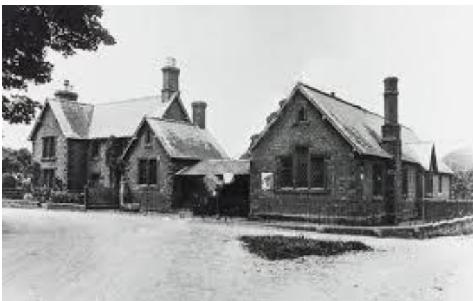
Welshampton School 1914

This event is not just about marking the years — it's about celebrating the people, stories, and spirit that make our school so special. Whether you're a former pupil, a current parent, or a friend of the school, we'd love for you to be part of this joyful occasion. Please spread the word.