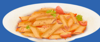
Hot pasta with tomato and mascarpone sauce. (V)