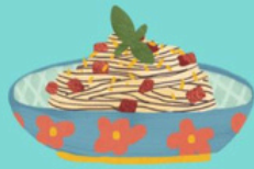
Build your own pasta