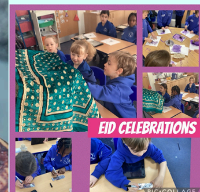
Year 2 created Eid cards, bangles and tried samosas.