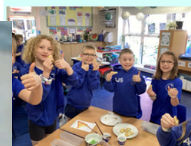
Tasting some yummy samosas