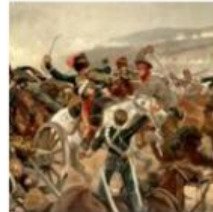
Crimean War 1853-1856