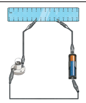
ruler = plastic = electrical insulators