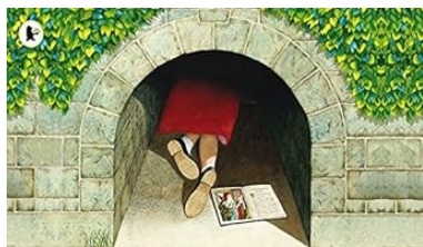
The Tunnel Anthony Browne