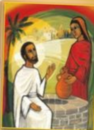
Sunday Gospel Gallery

Look at this Sunday's Gospel picture. What can you see? How do you feel? What does it make you think about?