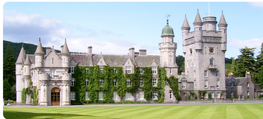
Balmoral Castle is in Aberdeenshire, Scotland.