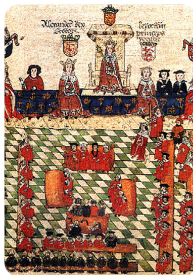
Edward I and the Model Parliament

The power of the monarchy has changed over time. In the past, some monarchs had absolute power. This meant that they could do whatever they wanted. Today, there is a constitutional monarchy. This means that the monarch is controlled by parliament and the government.