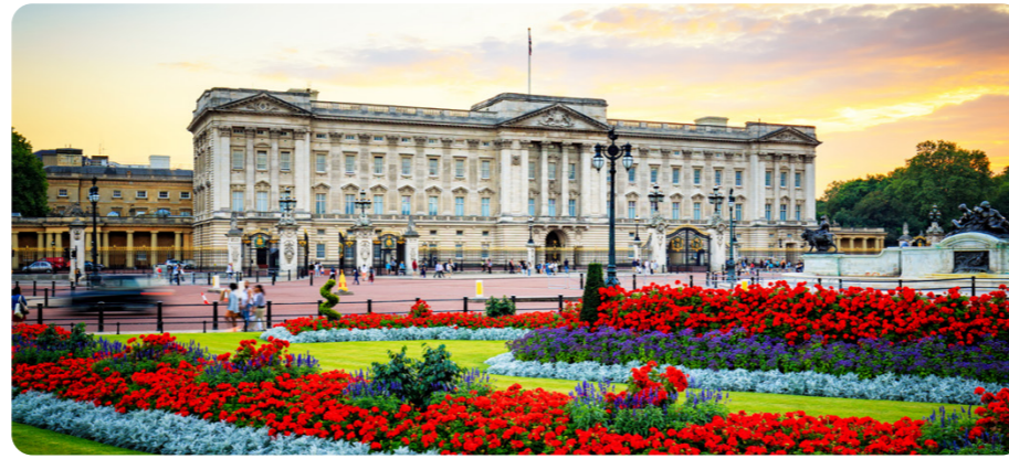
Buckingham Palace is in London, England.

Royal residences include palaces, castles and stately homes. Some of them are used for official royal business. Some are used as holiday or private homes. Many are tourist attractions.