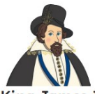
King James I