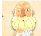
SOCRATES 469-399 BCE