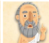
HIPPOCRATES 460-370 BCE