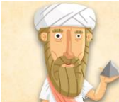
PYTHAGORAS 570-495 BCE

A PHILOSOPHER IS SOMEONE WHO THINKS DEEPLY AND SERIOUSLY ABOUT LIFE AND OTHER MATTERS.