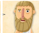
PLATO 427-348 BCE