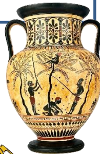
ANCIENT GREEK VASE