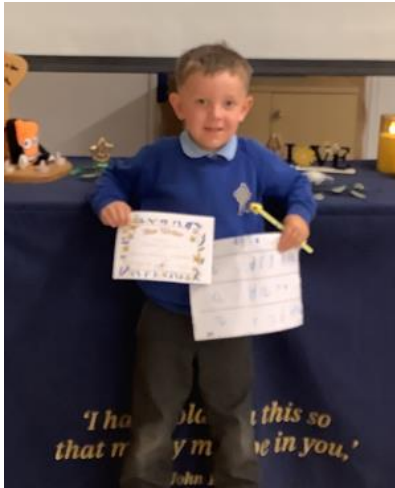
Reception class award winner