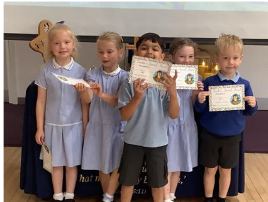
Year 1 award winners