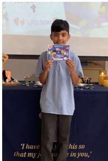
Year 4 award winner