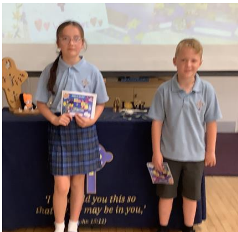
Year 3 award winners