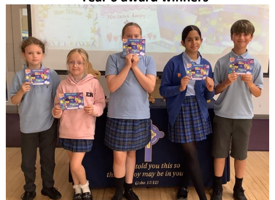
Year 6 award winners