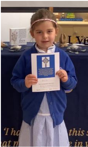
Reception class award winner