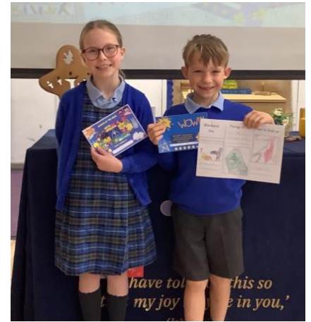
Year 2 award winners