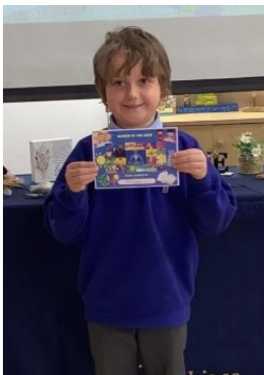
Year 3 award winner