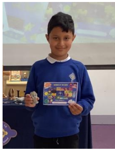
Year 4 award winner