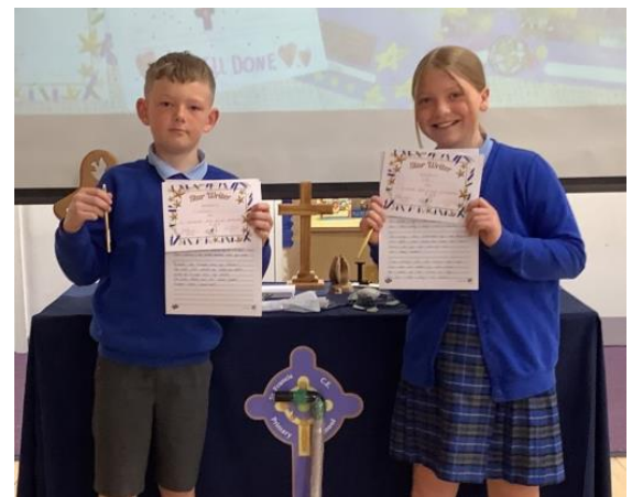
Year 6 award winners