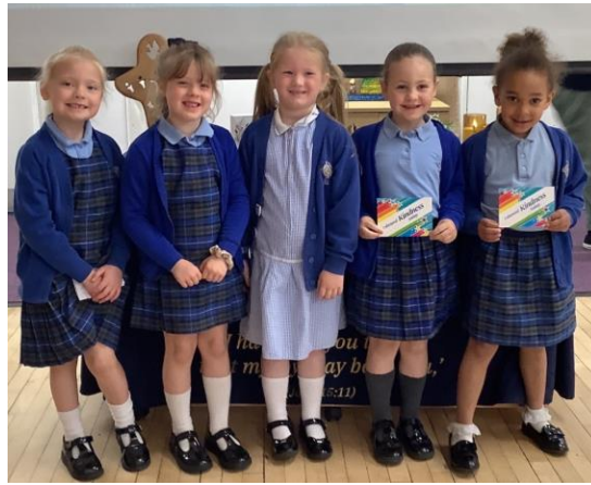
Year 1 award winners