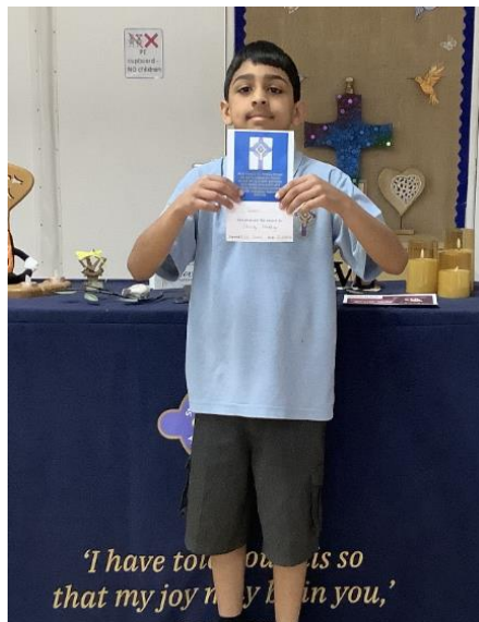
Year 4 award winner