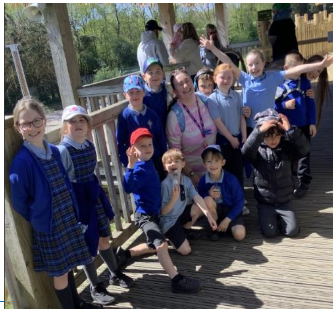
Our Y2 class enjoying their recent trip to Blackpool Zoo!