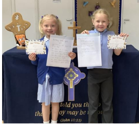
Year 1 award winners