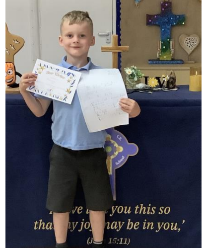
Year 2 award winner