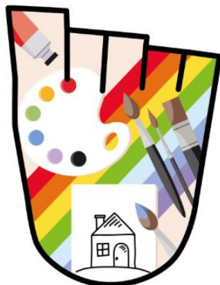
Year 6 award winners

Those children who have walked to school at least once a week during the month of April will receive their next badge next week.