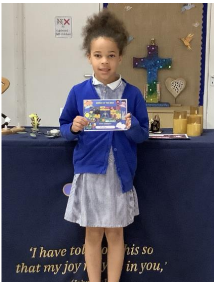
Year 3 award winner