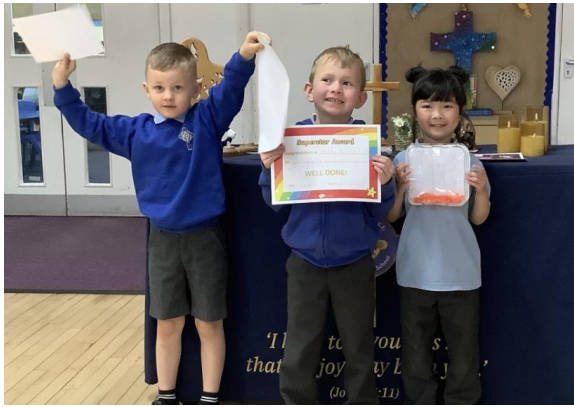
Reception class award winners