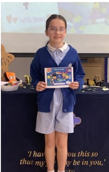
Year 3 award winner