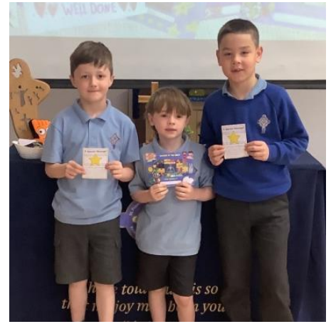
Year 2 award winners