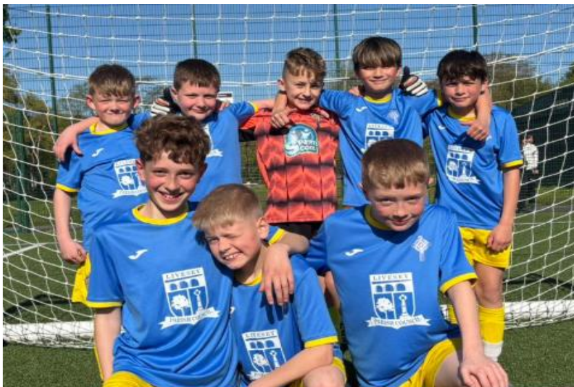
Year 6 award winner

Well done to our Y5/6 Boys' Football team this week, for their amazing attitudes, behaviours and skills during their matches. They won both games by a sizeable score. We are proud of them all, as always!