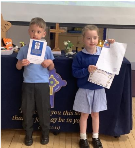
Reception class award winners