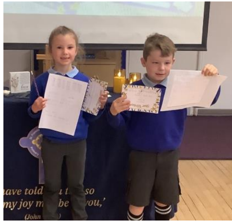
Year 1 award winners