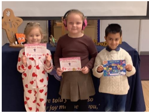
Reception class award winners