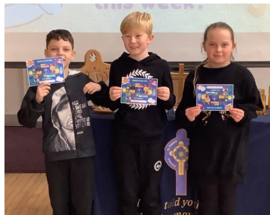
Year 4 award winners