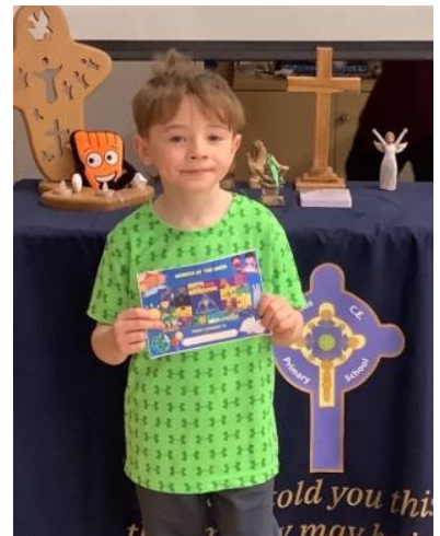
Year 2 award winner