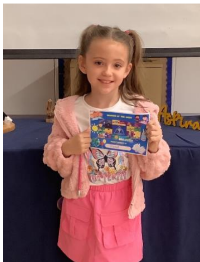
Year 3 award winner