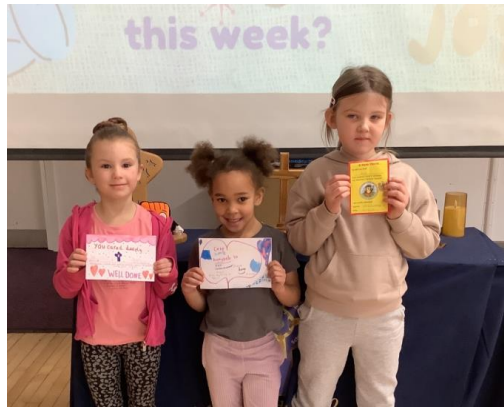
Year 1 award winners