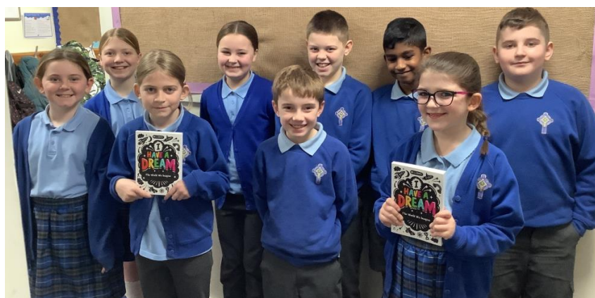
Y6 award winners

Our Year 5 children took part in the young writers competition to write a poem. The prompt was "I have a dream". Nine of our year 5s were chosen and their work has been published in a book. Fantastic Year 5!