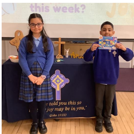
Year 4 award winners