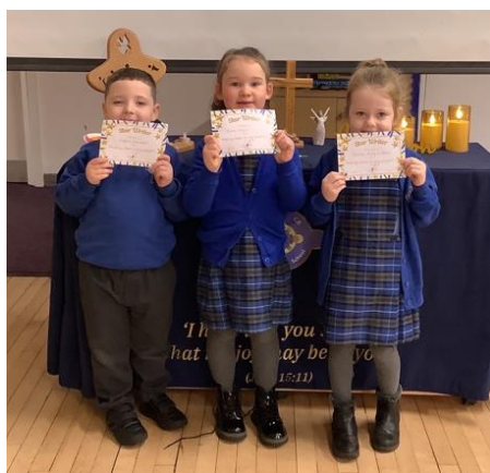
Reception class award winners