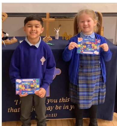
Year 1 award winners