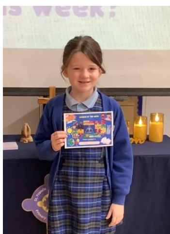
Year 3 award winner