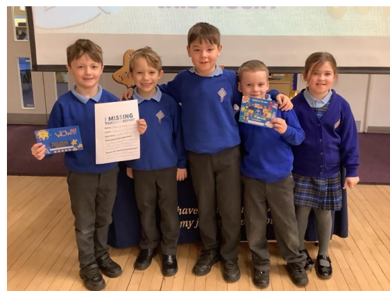
Year 2 award winners