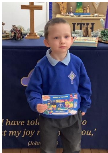
Reception class winner