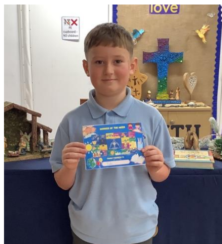
Year 4 award winner