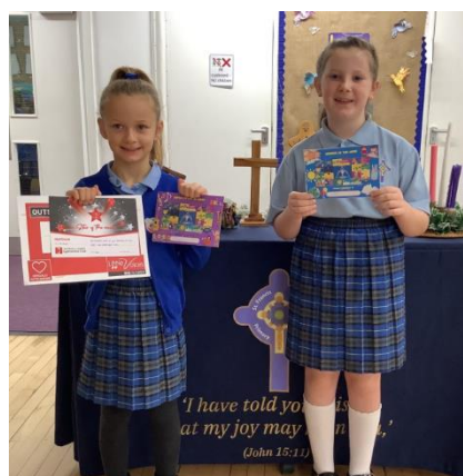
Year 3 award winners