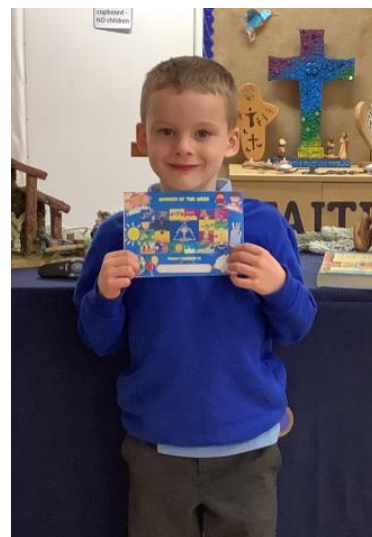
Year 2 award winner