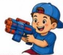
NERF GUN CHALLENGE