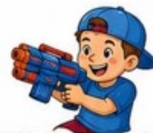
NERF GUN CHALLENGE