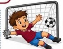
BEAT THE GOALIE