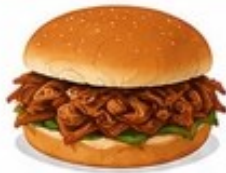
PULLED PORK BARMS