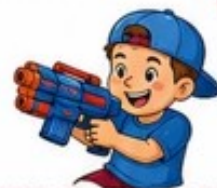
NERF GUN CHALLENGE