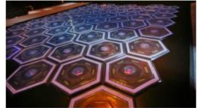
Grid of stones