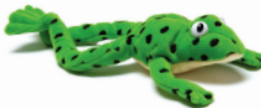
Fred says the sounds and children work out the word.

You can help your child to read words by following these steps: