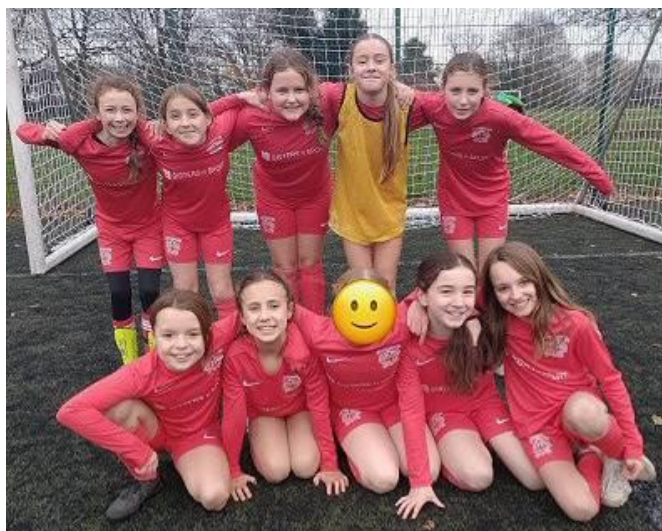
Y6 Girls Football Squad