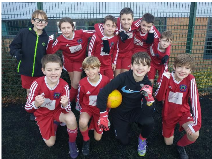
Y6 Mixed Football Squad: Chester area runners-up

Our Year 6 mixed and girls' football teams recently took part in English Schools Football Association tournaments at Christleton High School. The girls' team performed impressively, remaining undefeated and only failing to progress from the group stage on goal difference (by one goal). The mixed team reached the final after dominating their group and then beating Cherry Grove 1-0 in the semi-final. Ultimately, runners-up medals awaited them in the final in a closely-fought match against Waverton, but their performance secured a place in the county finals in the new year (for the second time in three years for our Y6 mixed team). The league programme for both teams has also now begun, with a notable win at Cherry Grove (4-2) for the girls' team.