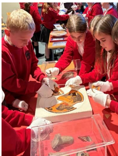
Y5 Greek Archeologists