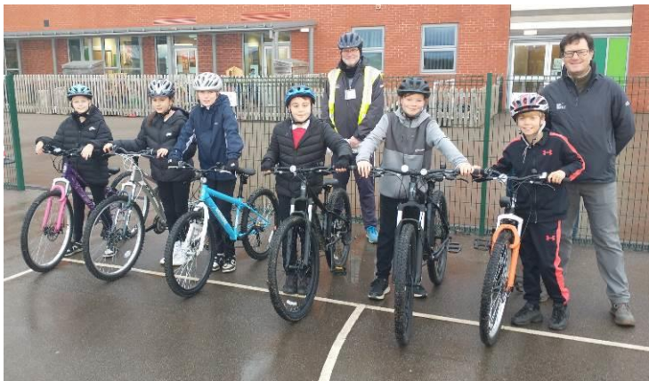
Y6 Bikeability Training