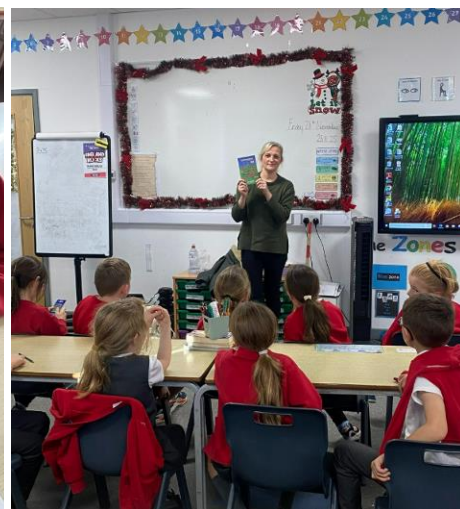
Author visit to Y3