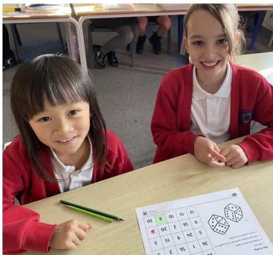
Maths Week: Y4 & Y6 teaming up