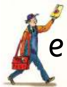
A better letter