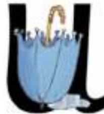
Down and under the umbrella, up to the top and down to the puddle