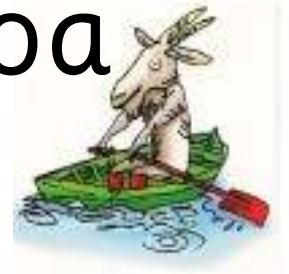
Goat in a boat