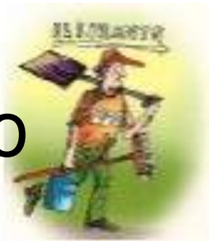
Poo at the zoo