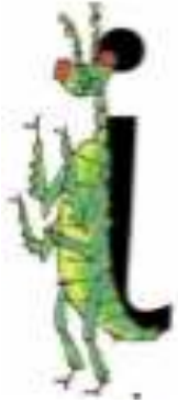
Down the insects body and a dot for his head.