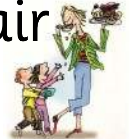
That's not fair