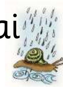
Snail in the rain