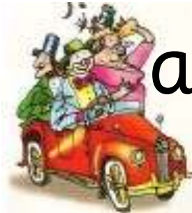
Start the car