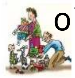
Spoil the boy