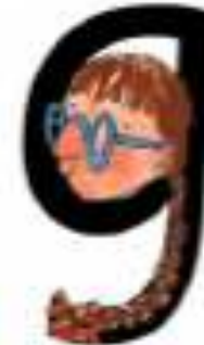
Round the girls face, down her hair and give her a curl