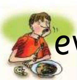
Chew and stew