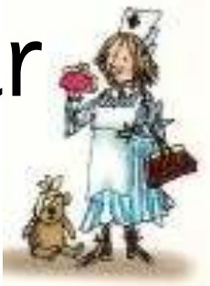
Nurse with a purse