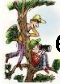
What can you see?