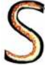
Slither down the snake