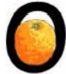
All around the orange