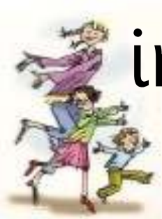
Whirl and twirl