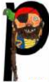
Down the pirates plait and around the pirates face