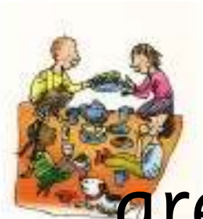
Care and share