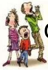
Shout it out