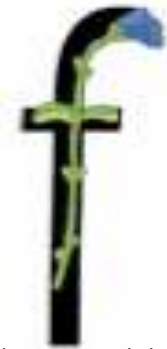
Down the stem and draw the leaves