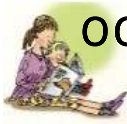
Look at a book