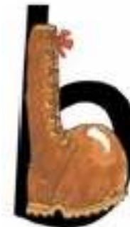
Down the laces, over the toe and to the heel