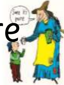
Sure its pure