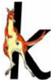
Down the kangaroo's body curl his tail and leg