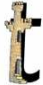
Down the tower, across the tower