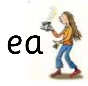
Cup of tea