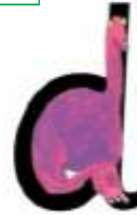
Around the dinosaurs bottom and up to his neck