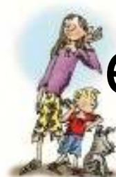
Hear with your ear