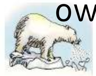
Blow the snow