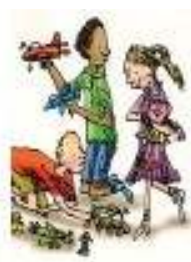
May I play?