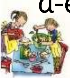
Make a cake