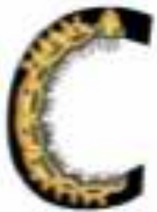
Curl around the caterpillar