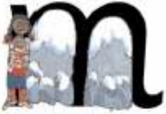
Maisie, mountain, mountain