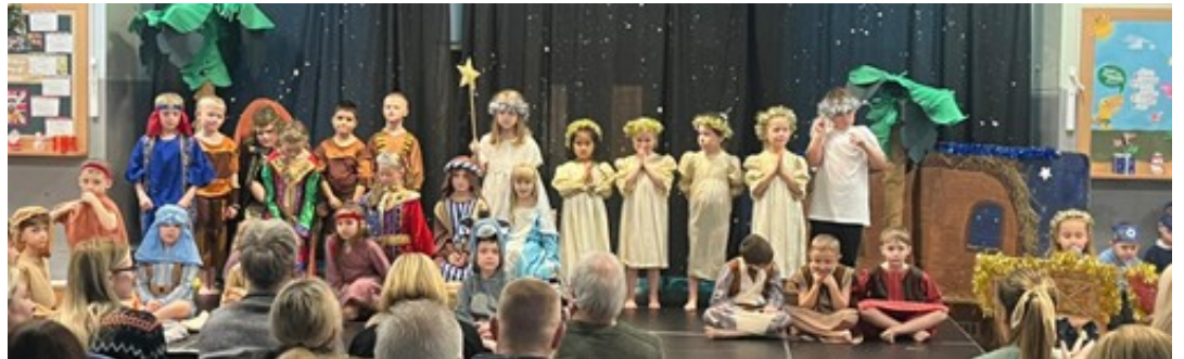
Key Stage 1 Nativity