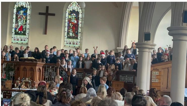
Key Stage 2 Concert