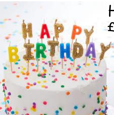
Happy Birthday candles £1.27