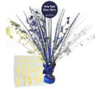
Table centre piece X1 £4.99