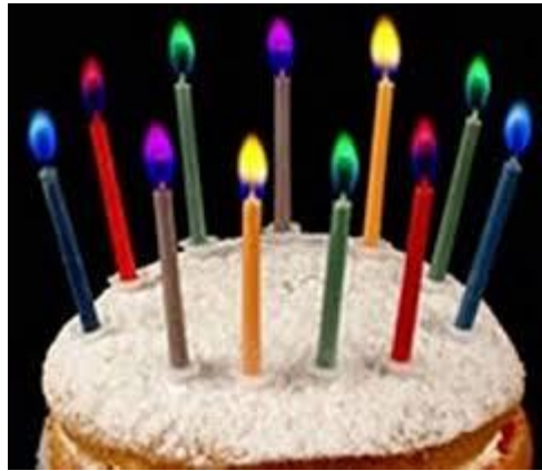
Colour changing candles £1.95 for 12