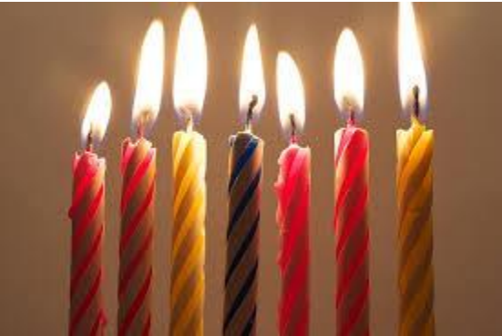
Candles £1.00 for 12