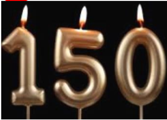
Multiple colours £0.75