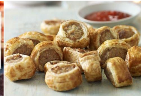
24 sausage rolls for £1.90

Plain Margarita Medium (8 slices) = £12.99 Plain Margarita Large (12 slices) = £13.99 2 or more toppings Medium = £14.99 2 or more toppings Large (12 slices) = £16.99