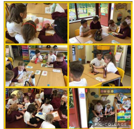
Year 5 reading with Year 2