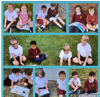
Year 3 reading with Year 1