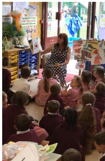
Year 4 story time in FS1