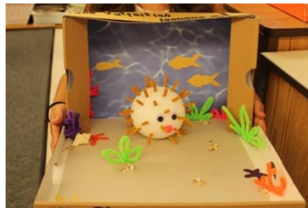
Puffer Fish Habitat