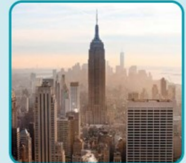
Empire State building, New York City (Shreve, Lamb & Harmon)