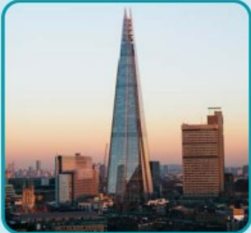
The Shard, London (Renzo Piano)