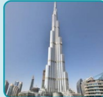
Burj Khalifa, Dubai (Adrian Smith)