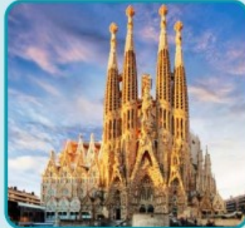
La Sagrada Família, Barcelona (Antoni Gaudí)