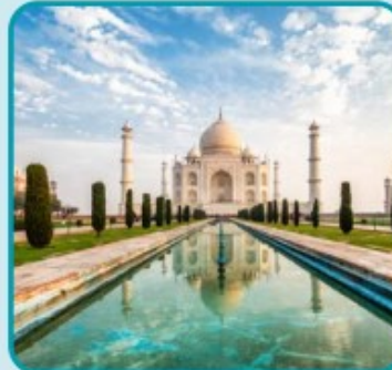
Taj Mahal, India (Ustad Ahmad Lahori)