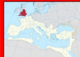
Roman Empire AD 43