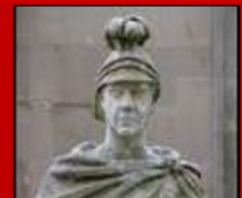
General Julius Agricola