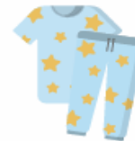
1 x Set of pyjamas