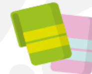
2 x Towels