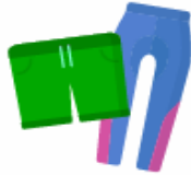
2 x Pair of shorts (knee length) (or leggings that can get wet)