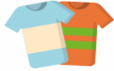
3 x T-Shirts (No vests or crop tops please)

(This list includes what you'll wear to Robinwood)