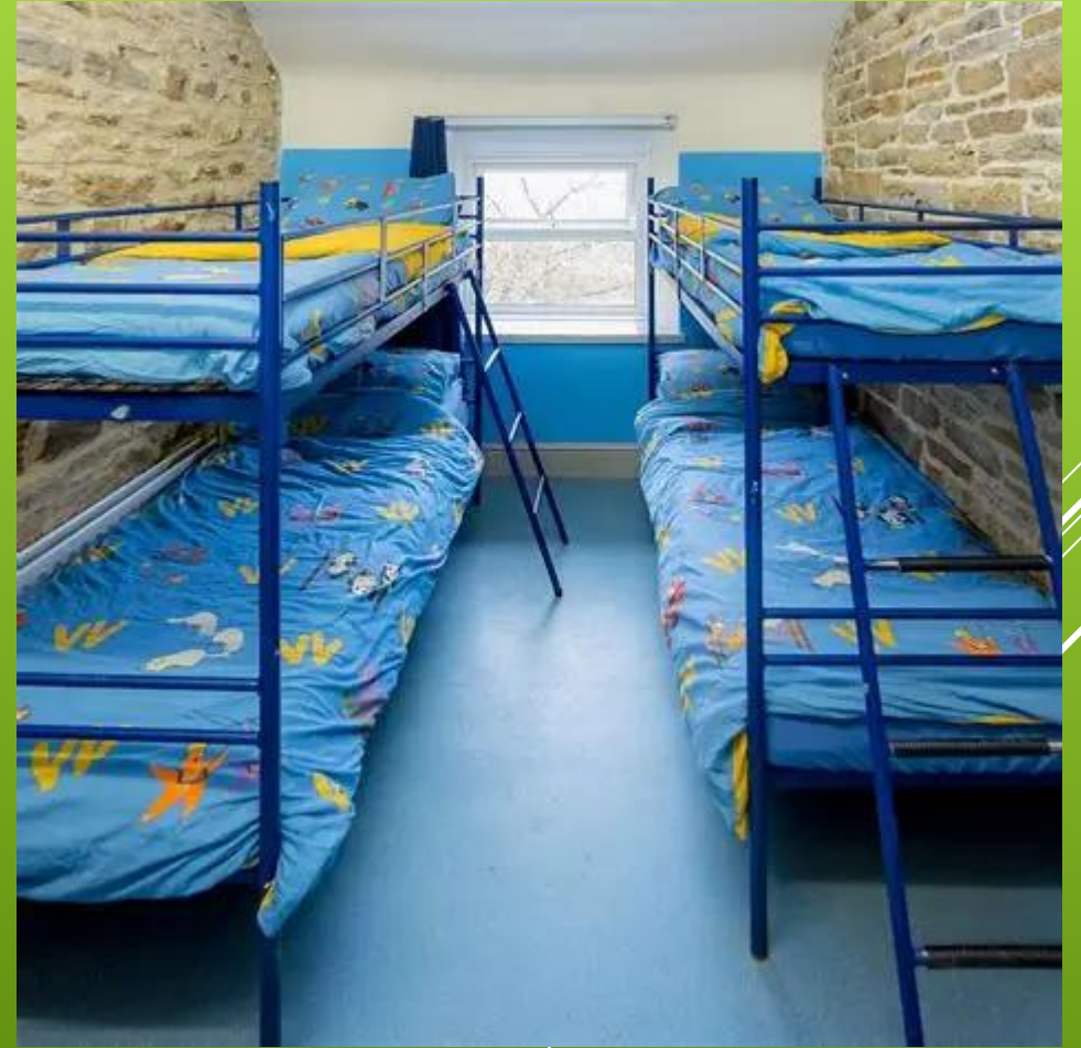
ROBINWOOD - WREXHAM