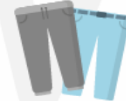
3 x Trousers (Ideally not jeans)