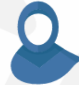
1 x spare Head Scarf (if you wear one)