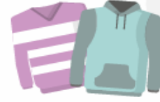
3 x Long Sleeve Tops (Jumpers/Hoodies etc)