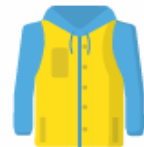
1 x Coat - ideally waterproof (For walking to centre)