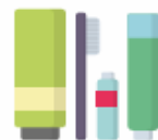
1 x Bag of toiletries (No aerosols please)