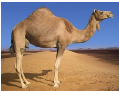
A camel in the desert (Arid climate)

Extension Homework—Can you think of 4 more animals and how they have adapted to their environments? Pick an animal from different climate zones.