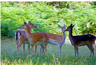
A deer in a forest (temperate climate)