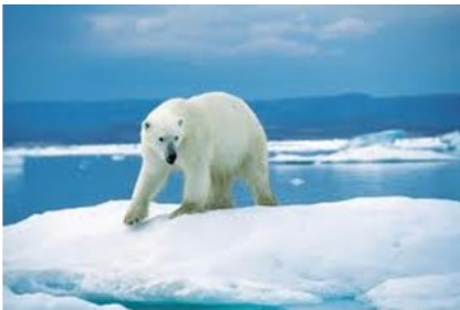
A polar bear in the Arctic (Polar climate)