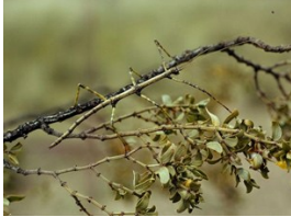
A stick insect in a rainforest (tropical climate)

List 2 or 3 ways that each animal is adapted to its habitat. The first one is done for you.