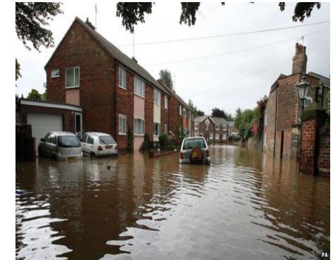
Impact of flooding