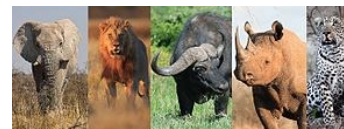
African animals in their natural habitat