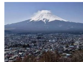
Mount Fuji volcano