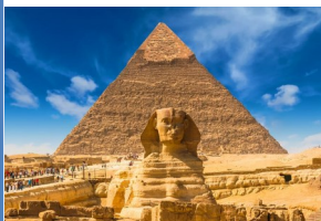
Pyramids in Egypt—Northern Africa