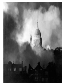
The Blitz— bombing raids on British cities and towns.