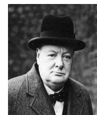
Winston Churchill— British Prime Minister for