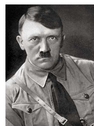
Adolf Hitler - Leader of Germany & the Nazis.