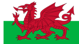
Flag of Wales