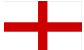
Flag of England