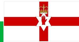
Flag of Northern Ireland