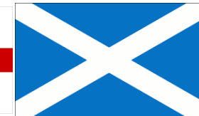
Flag of Scotland