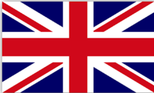
The Union Flag of Great Britain

A Patron Saint is the protecting or guiding saint of a person or place.