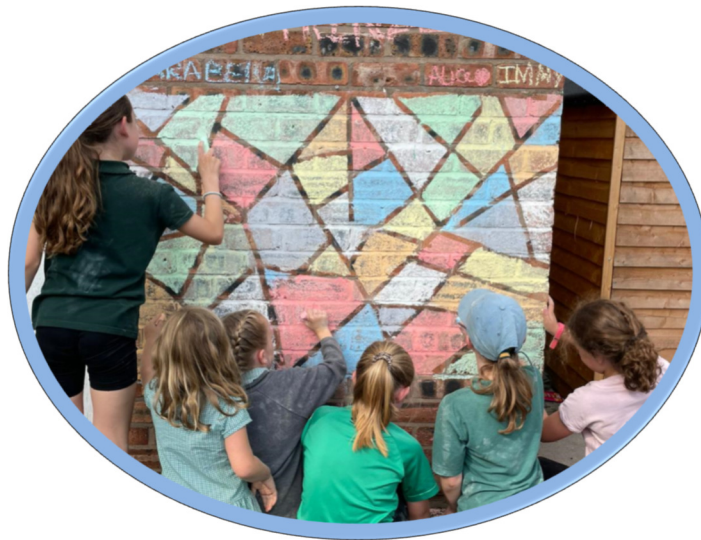
'Wall Art' using chalk'