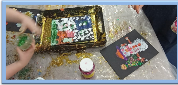
'Christmas themed painting'