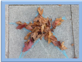
'Playground Autumn Leaf Art'