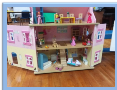
'Dolls House & Role play'

'Bunbury Badgers' is a fun environment that is well resourced with a range of activities to suit All ages and interests.