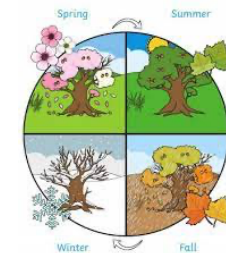
Order of Seasons

Science – In science we are looking at the four seasons. Can you finish the worksheet matching putting the months into the right seasons and drawing a picture showing what the weather is like in those seasons.