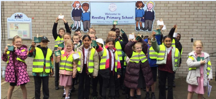
Children from Holy Trinity