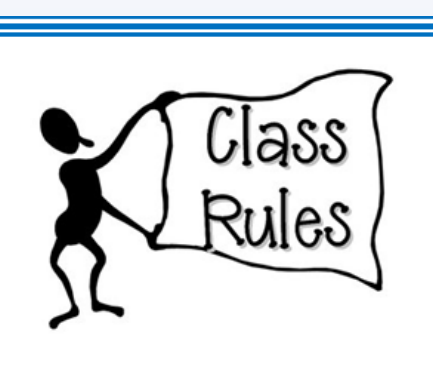
Clear, consistent rules and routines