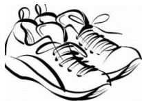
Trainers or pumps

Please make sure that earrings are removed for P.E. days.