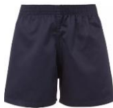
Navy blue or black shorts